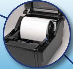
Drop - Load - Go Media Bin