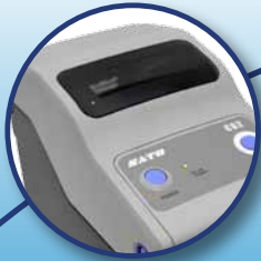
Anti-Microbial Casing (CG2 only)