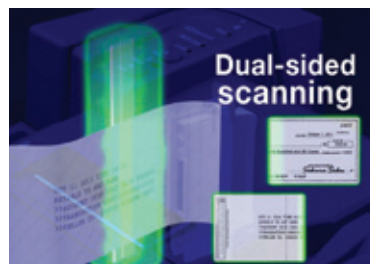
Two-sided scanning meets FSTC (IQA) and Check 21 standards

Epson's TM-S9000 features the fastest check scanning available with speeds up to 200 dpm and virtually trouble-free performance with a rating of 4.94 million Mean Cycles Between Failure.