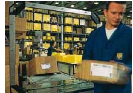
Manual Postal sorting