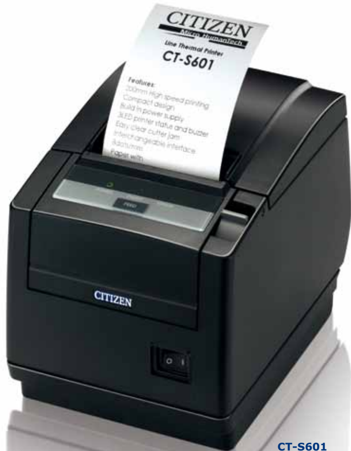
CT-S601 (available in black or white)