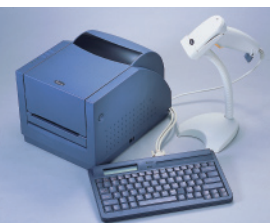
> Standalone mode with Argokee

The R-600 inherits the Refine Series' mechanism. Loading capacity accommodates a maximum 360M ribbon roll and 6" OD media supply. Adjustable media guide with centralized alignment fits all variable media from 25.4mm to 118mm. Easy access via a three-button control panel saves time and requires minimal training allowing the benefits of easy and fast handling. Built-in universal switch power offers 100% flexibility to fit in any local application environment, and it is lightweight, space-saving, and easy to handle. The R-600 maintains high quality printing with 300dpi resolution making it the value-added printer of choice for textile and care labeling applications.