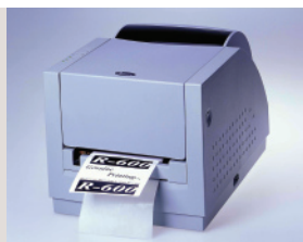
> Dispenser mode