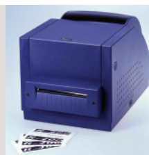
> Cutter mode