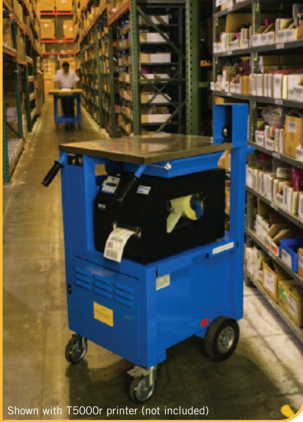
Shown with T5000r printer (not included)